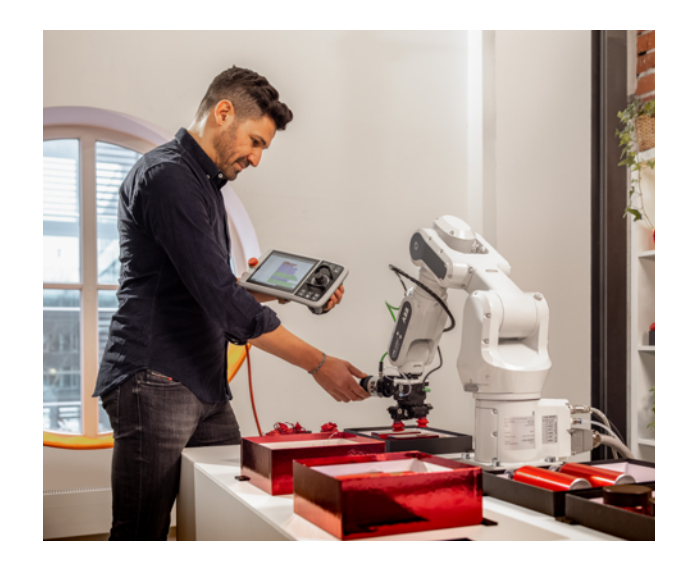
Working range, CRB 1100-4/0.475