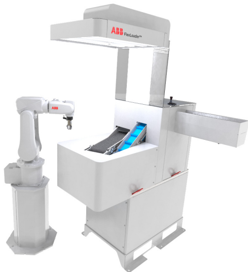
— 01 FlexLoader FP 100 with IRB 1200 robot.

ABB's FlexLoader FP 100 capitalizes on ABB's long experience in developing and manufacturing machine tending solutions for integrators and end-users worldwide in machining and injection molding operations. However it can also be used in many other applications as a general feeder in a robot cell.